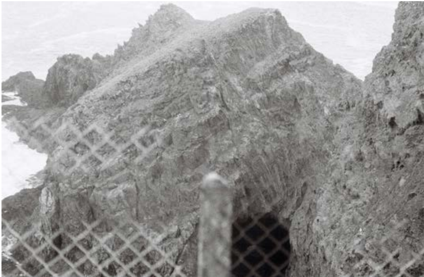
A rusted metal fence signals the approach to Penhale.